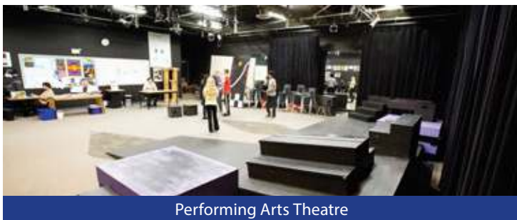
Performing Arts Theatre