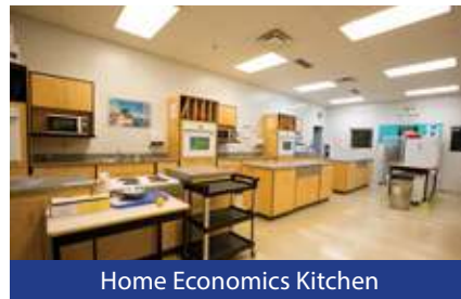
Home Economics Kitchen