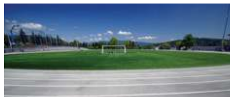
Soccer Field and Running Track