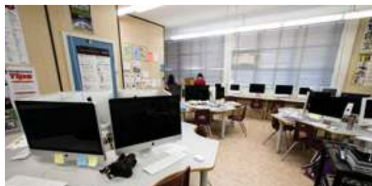
Mac Computer Lab