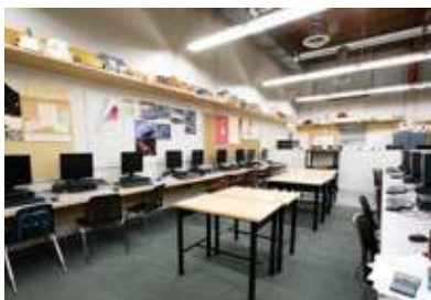
PC Computer Lab