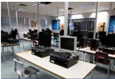
PC Computer Lab