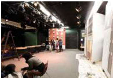
Dramatic Arts Classroom