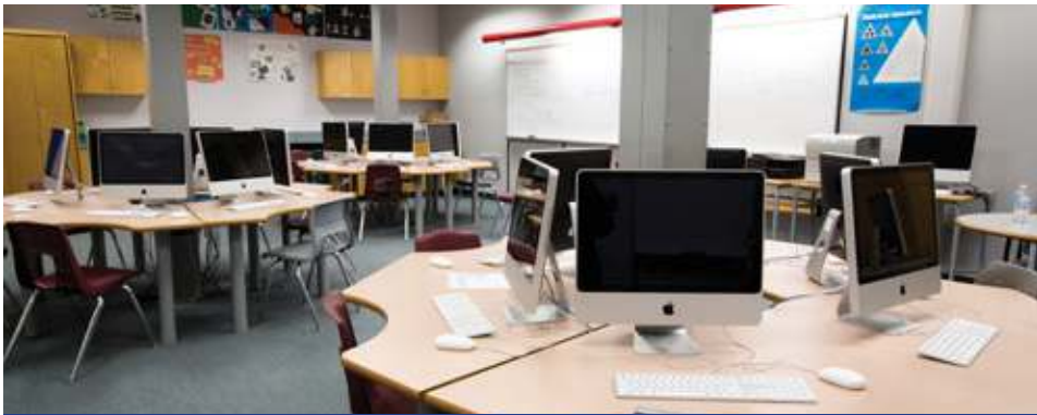
Mac Computer Lab