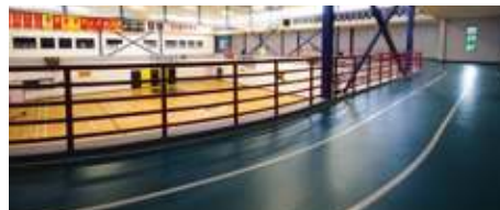
Indoor Running Track