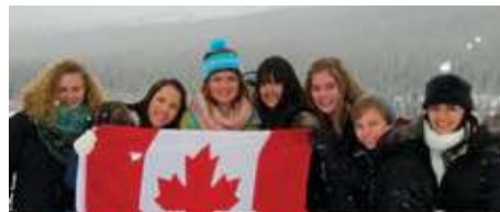
Skiing Field Trip