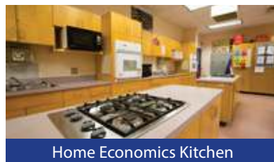
Home Economics Kitchen