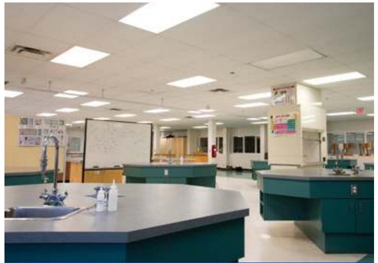
Science Super Lab