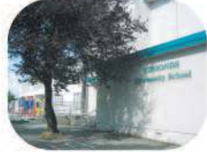
13 Edmonds Community Elementary 7651 18th Ave. Burnaby, BC V3N 1J1