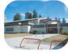
37 Taylor Park Elementary 7590 Mission Ave. Burnaby, BC V3N 5C7