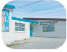
4 Brentwood Park Elementary 1455 Delta Ave. Burnaby, BC V5B 3G4