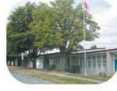
18 Inman Elementary 3963 Brandon St. Burnaby, BC V5G 2P6