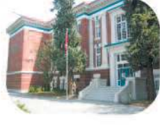
15 Gilmore Community Elementary 50 S. Gilmore Ave. Burnaby, BC V5C 4P5