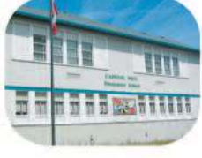
7 Capitol Hill Elementary 350 S. Holdom Ave. Burnaby, BC V5B 3V1