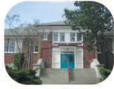
12 Douglas Road Elementary 4861 Canada Way Burnaby, BC V5G 1L7