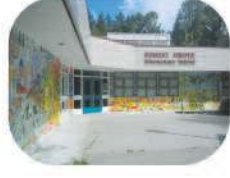
14 Forest Grove Elementary 8525 Forest Grove Dr. Burnaby, BC V5A 4H5