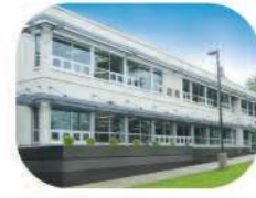
39 University Highlands Elementary 9388 Tower Road Burnaby, BC V5A 4X6