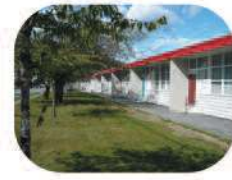
40 Westridge Elementary 510 Duncan Ave. Burnaby, BC V5B 4L9