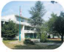
23 Marlborough Elementary 6060 Marlborough Ave. Burnaby, BC V5H 3L7