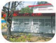
1 Armstrong Elementary 8757 Armstrong Ave. Burnaby, BC V3N 2H8