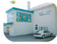
35 Stride Avenue Community Elementary 7014 Stride Ave. Burnaby, BC V3N 1T4