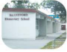
3 Brantford Elementary 6512 Brantford Ave. Burnaby, BC V5E 2S1