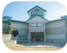
32 South Slope Elementary 4446 Walling St. Burnaby, BC V5J 5H3