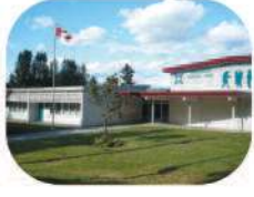
5 Buckingham Elementary 6066 Buckingham Ave. Burnaby, BC V5E 2A4