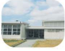
8 Cascade Heights Elementary 4343 Smith Ave. Burnaby, BC V5G 2V5