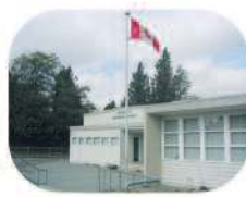
26 Morley Elementary 7355 Morley St. Burnaby, BC V5E 2K1