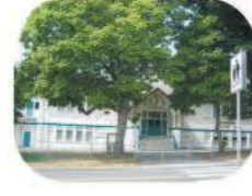
19 Kitchener Elementary 1351 S. Gilmore Ave. Burnaby, BC V5C 4S8