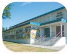
33 Sperling Elementary 2200 Sperling Ave. Burnaby, BC V5B 4K7