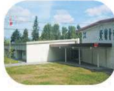
28 Parkcrest Elementary 6055 Halifax St. Burnaby, BC V5B 2P4