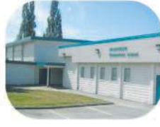
30 Seaforth Elementary 7881 Government Rd. Burnaby, BC V5A 2C9