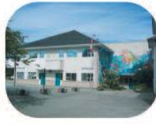
31 Second Street Community Elementary 7502 Second St. Burnaby, BC V3N 3R5