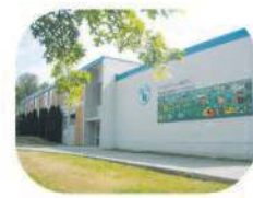
34 Stoney Creek Community Elementary 2740 Beaverbrook Cr. Burnaby, BC V3J 7B6