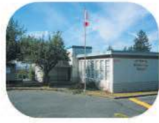
10 Clinton Elementary 5858 Clinton St. Burnaby, BC V5J 2M3