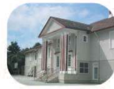
41 Windsor Elementary 6166 Imperial St. Burnaby, BC V5J 1G5