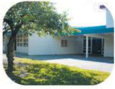
2 Aubrey Elementary 1075 Strafford Ave. Burnaby, BC V5B 3X9