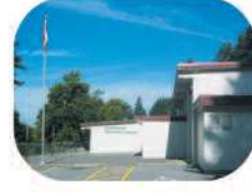
17 Glenwood Elementary 5787 Marine Dr. Burnaby, BC V5J 3H1