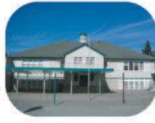
27 Nelson Elementary 4850 Irmin St. Burnaby, BC V5J 1Y2