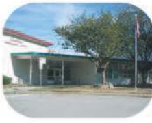
24 Maywood Community Elementary 4567 Imperial St. Burnaby, BC V5J 1B7