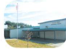
38 Twelfth Avenue Elementary 7622 12th Ave. Burnaby, BC V3N 2K1