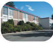
25 Montecito Elementary 2176 Duthie Ave. Burnaby, BC V5A 2S2