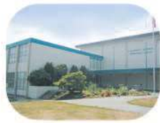
9 Chaffey-Burke Elementary 4404 Sardis St. Burnaby, BC V5H 1K7