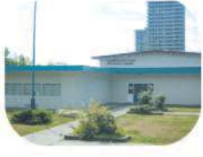
6 Cameron Elementary 9540 Erickson Dr. Burnaby, BC V3J 1M9