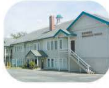
29 Rosser Elementary 4375 Pandora St. Burnaby, BC V5C 2B6