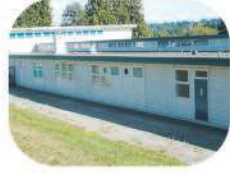
16 Gilpin Elementary 5490 Eglinton St. Burnaby, BC V5G 2B2