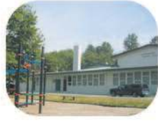
11 Confederation Park Elementary 4715 Pandora St. Burnaby, BC V5C 2C2