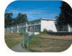
36 Suncrest Elementary 3883 Rumble St. Burnaby, BC V5J 1Z5