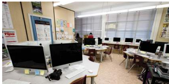
Mac Computer Lab