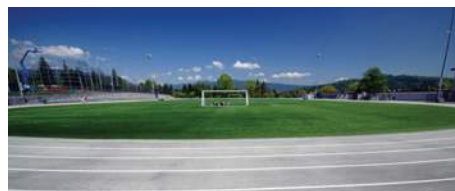
Soccer Field and Running Track