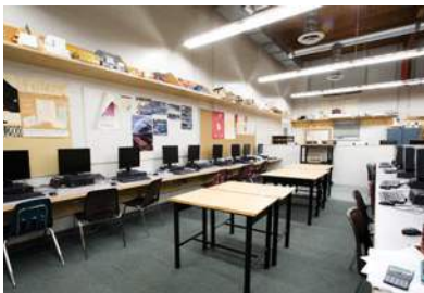
PC Computer Lab