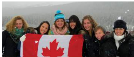
Skiing Field Trip