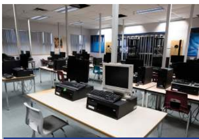
PC Computer Lab