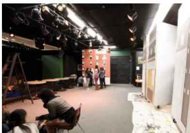
Dramatic Arts Classroom