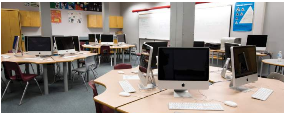
Mac Computer Lab

Anime, Badminton, Break Dance, Cheerleading, Chess, Debating, Math, Music, Newspaper, Peacemakers, Ski/Snowboard, Table Tennis, and many more