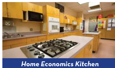
Home Economics Kitchen