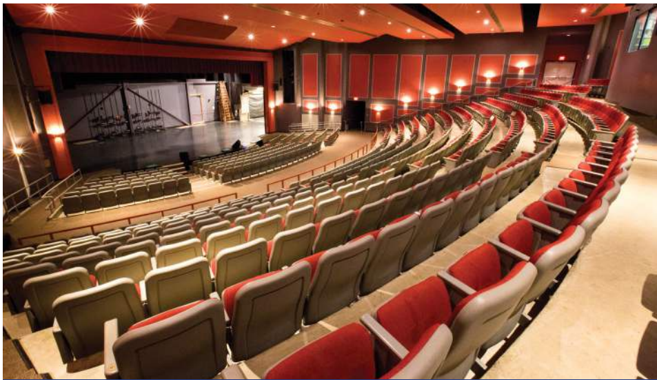
Auditorium / Performing Arts Theatre