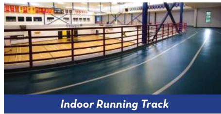
Indoor Running Track