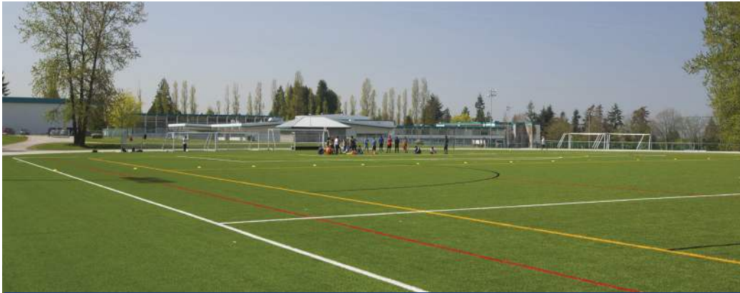
Sports Field and School

One of eight secondary schools (Grades 8 – 12) located in Burnaby, (Greater Vancouver) Canada. Start Dates September & Limited Spaces in February Student Population 675