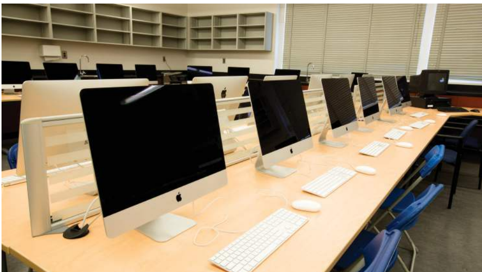
IT / Computer Lab