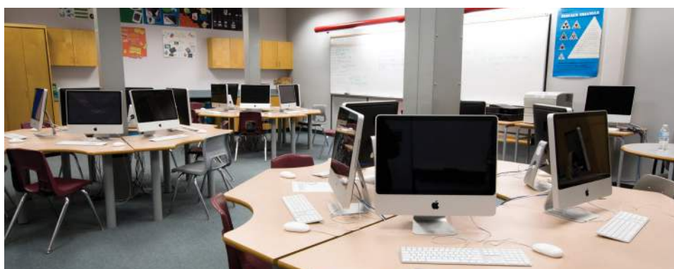
Mac Computer Lab