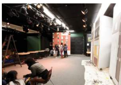
Dramatic Arts Classroom