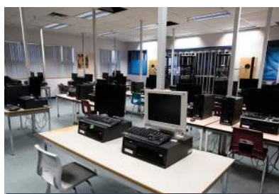
PC Computer Lab