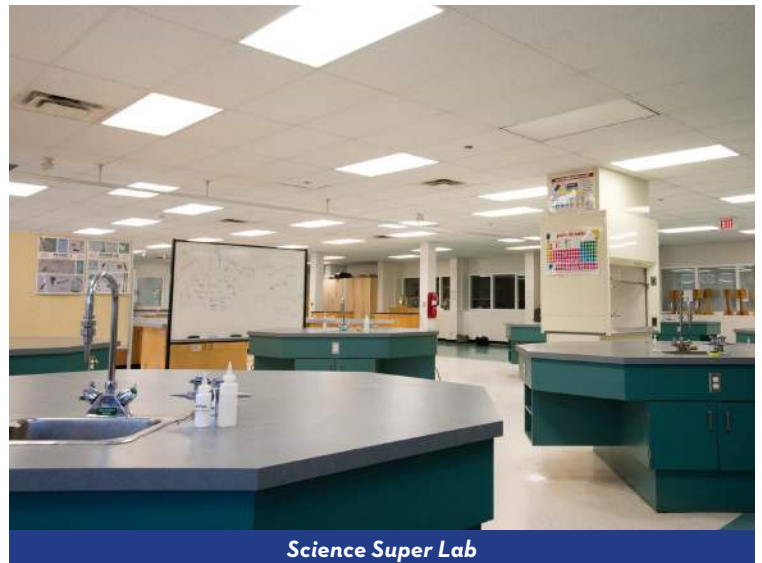
Science Super Lab